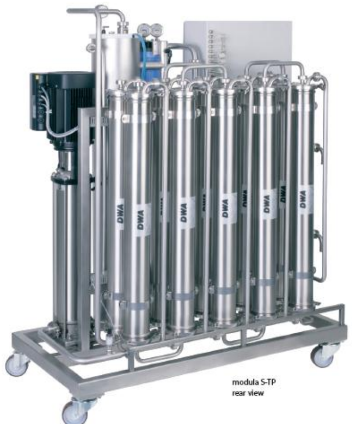
modula S-TP rear view