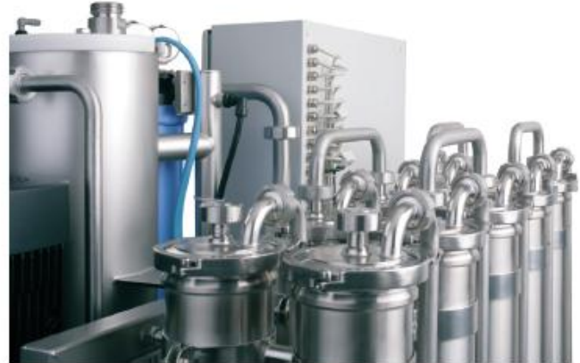
modula S-TP detail view