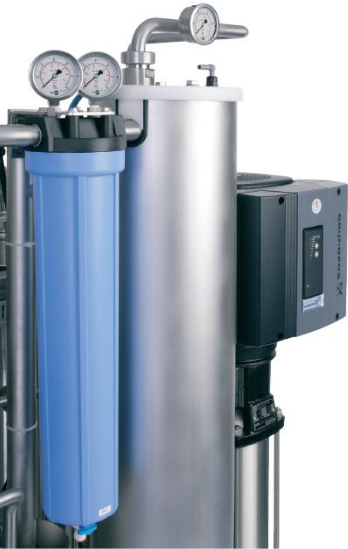
modula S-TP — detail view

The twin-pass modula S-TP has been designed for use with poor feed water quality or when higher levels of permeate chemical purity are required.