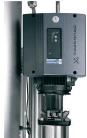
modula S-TP frequency controlled pump